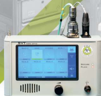
SVT- Secure Voice Terminal (made by PGZ SW)