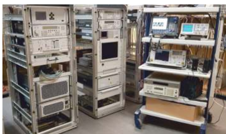
„19” racks with communication system (made by PGZ SW)