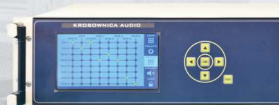
Data matrix switcher (made by PGZ SW)